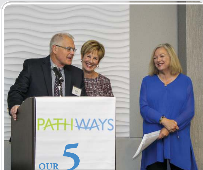
EVENTS BRING THIS COMMUNITY TOGETHER

ONE FROM THE HEART — OCTOBER Our annual fundraising breakfast and awards event honors all donors for their valued support and generosity. Please join us on October 25, 2018